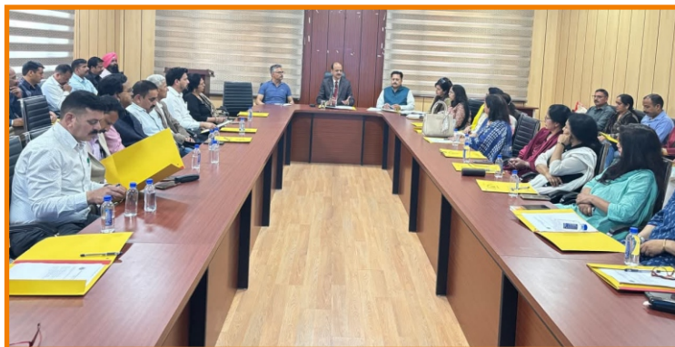
Sports and Cultural Council Meeting