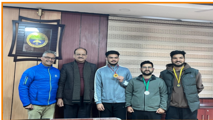
Position holders Table Tennis (Men) Tournament