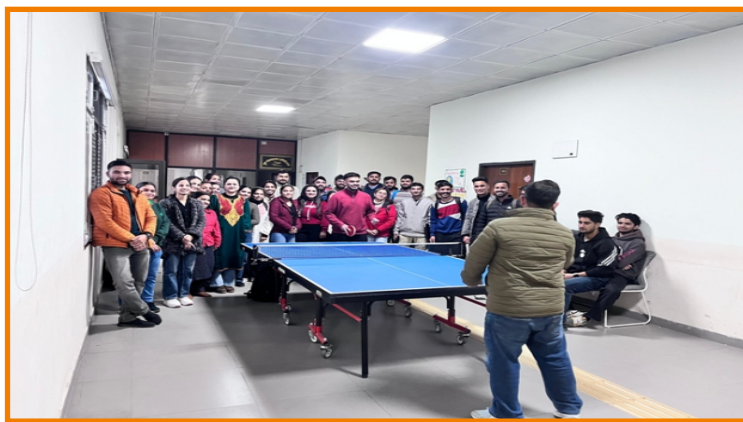
Table Tennis (Men) Tournament