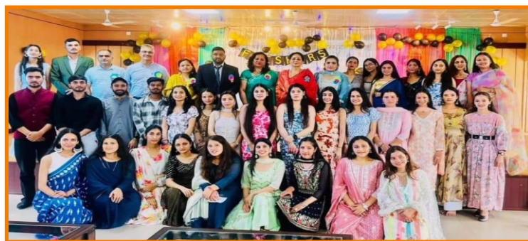
Freshers Day Celebration