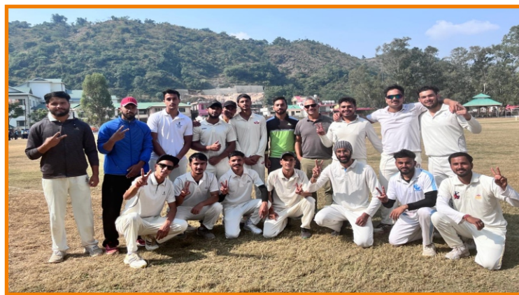
Cricket Team SPU (Men) beat RRC Bhota by 130 runs