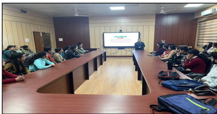
Road Safety Awareness Initiatives-Organized By Road Safety Club SPU