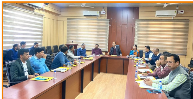
Academic Council Meeting